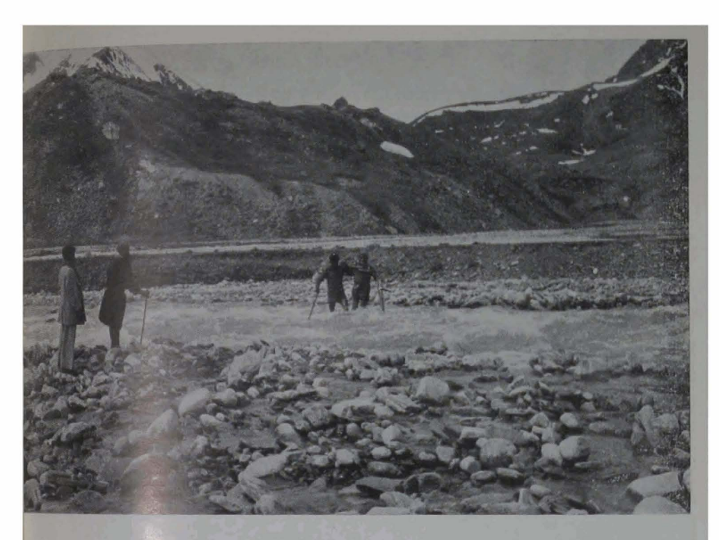
PORTER NAMGYAL ASSISTS ANTONIA DEACOCK ACROSS A MOUNTAIN STREAM, 14,000 FT.