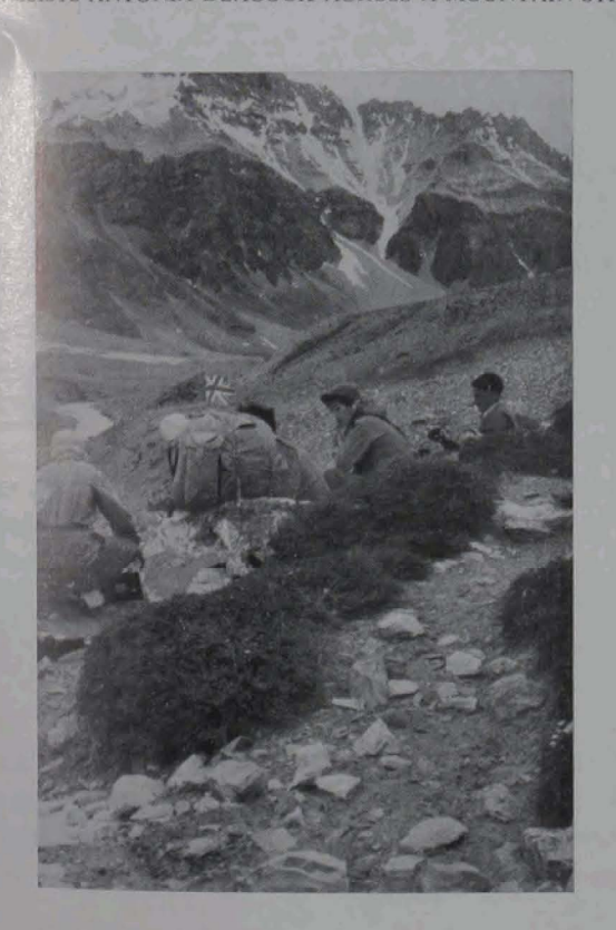
EVE SIMS, PORTER NAMGYAL AND ANTONIA DEACOCK REST ON THE 14,000 FT. LINGTI PLAIN IN RUPSHU